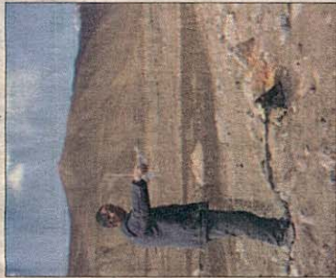
A traditional blessing is offered in the Tibetan highlands.