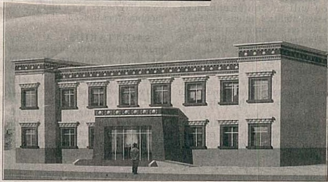
THIS COMPUTER-GENERATED GRAPHIC shows what the TibetanAid Foundation's medical clinic will look like upon completion.